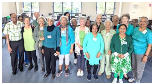
Monday's Seniors @ the Bay Group – Feb 2023