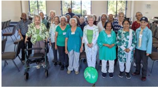
Friday's Seniors @ the Bay Group – Feb 2023