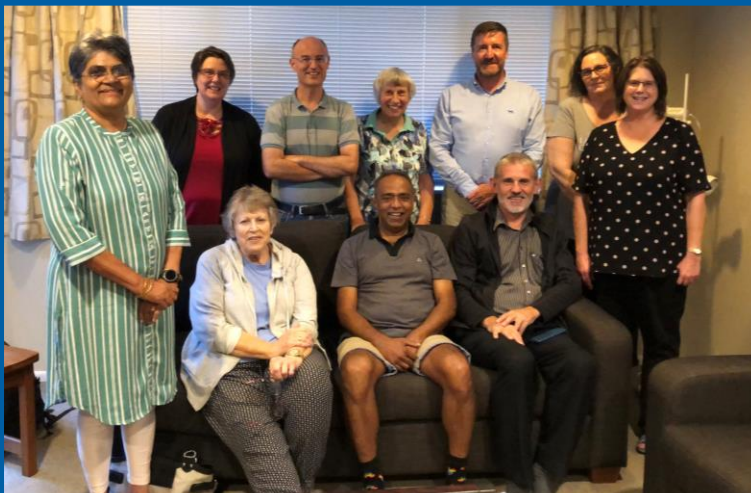
Our Lay Leaders – Vestry, Church Wardens & Licenced Lay Ministers.

At every level, volunteers ensure the ministry of the church is alive and vibrant. There has been a long tradition of active lay involvement in all the ministries and activities of the church.