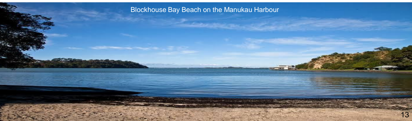
Blockhouse Bay Beach on the Manukau Harbour