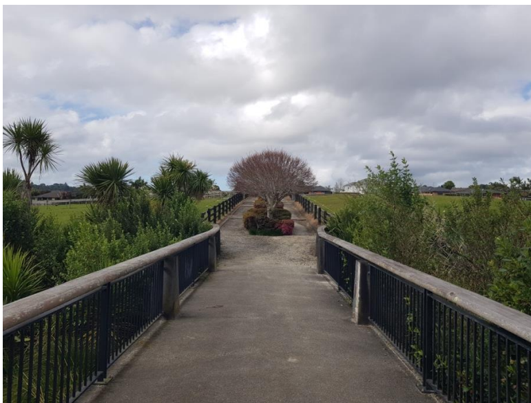
WAINONI PARK, GREENHITHE