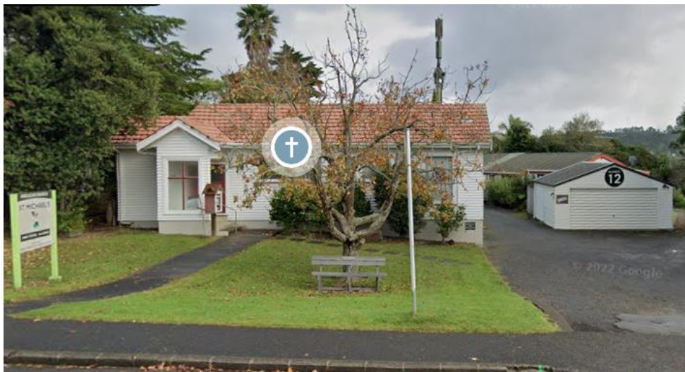
ST MICHAEL'S CHURCH – 12 GREENHITHE RD, GREENHITHE