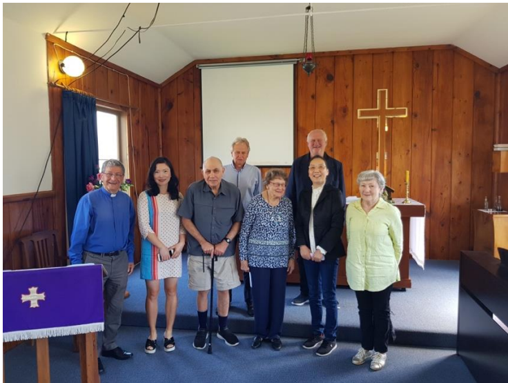
PARISHIONERS GATHER AFTER A GREENHITHE SERVICE

Currently a relatively small group worships at St Michael and All Angels in Greenhithe. However, the Greenhithe area is still growing in population, and if we are able to grow the congregation, in 2026 there is the opportunity to return to using the site full time, rather than just on Sunday. St Michael’s also has a long-standing agreement with the Methodist Church of New Zealand to formally represent the MCNZ in Greenhithe, and provides a “Methodist style” worship each month.