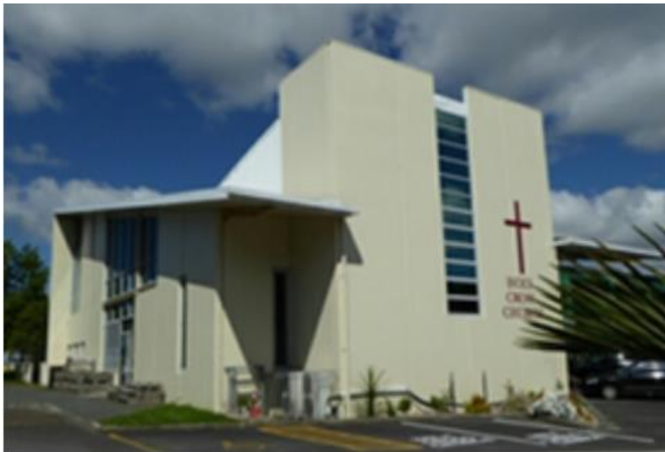
HOLY CROSS CHURCH – 222 DAIRY FLAT HIGHWAY, ALBANY