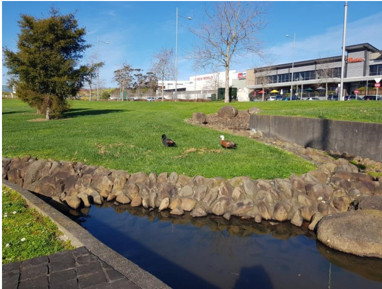
ALBANY LAKES AREA OUTSIDE WESTFIELD MALL