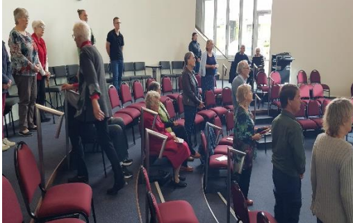
HOLY CROSS TIERED SEATING

The church owns Apollo House, (adjacent to the church), which is leased to an accounting firm.