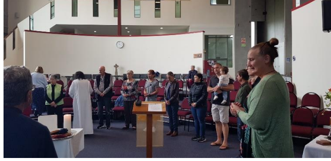
HOLY CROSS CIRCLE FOR COMMUNION

The St Michael’s site (church, church hall, and “vicarage”) is currently all leased to Shore Grace church. The church is used by the mission district only for a Sunday service, followed by morning tea in the vicarage. The lease agreement is in place until April 2026.